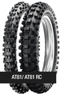
AT81/ AT81 RC